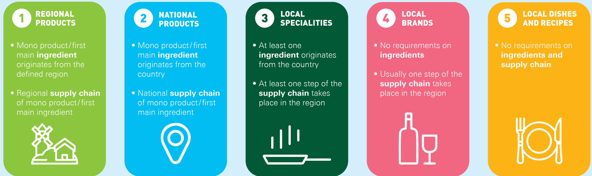
Figure 1: ALDI Nord 5-Column Model of Local Food: An Overview

From a sustainability perspective, ALDI Nord prefers regional and national products (columns 1 and 2) over local specialities and local brands (columns 3 and 4), as the former contribute more holistically to environmentally friendly consumption. We therefore focus on offering regional and national articles. In countries with only small ranges of regional products, national articles are prioritised, followed by offerings of local specialities and brands.